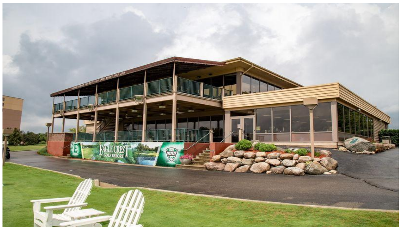
Follow us on Facebook, Instagram & Twitter